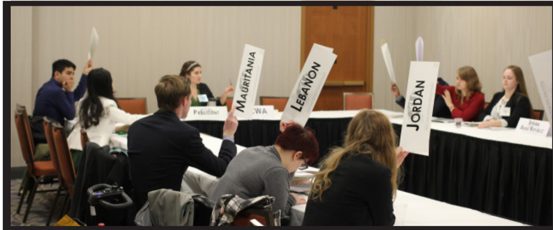
Representatives on the Economic and Social Commission on Western Asia voting.

ECOSOC is at an impasse as its members consider whether to jump to its next topic from the current one it has been covering. Representatives express concern that ECOSOC has not resolved its first topic and are thus split across the topics with no clear majority.