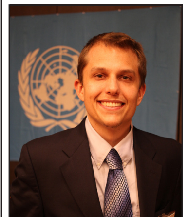
Jacques Belzal International Court of Justice