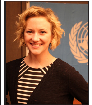
Crystal Ham Historical Security Council 2003

Meet your 2015 IPD Reporters! If you haven't already seen us around your committee, you likely will soon. We would invite you to come talk with us about what you're working on, what you think of the current topic in your committee or how AMUN is going for you this year! We love gathering quotes, pictures, press conferences and putting together committee updates in order to provide you, the readers, with a robust picture of conference.