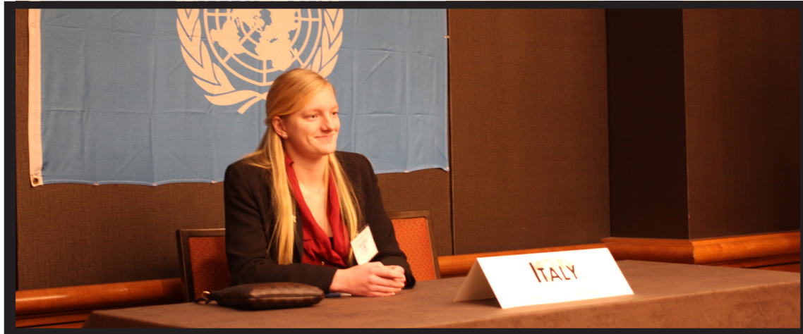
Representative Alina Clough of Italy holds the first press conference of 2015, discussing drug trafficking for the Commission on Narcotic Drugs

The body brought forth a motion to limit substantive speeches to three minutes with five points of inquiry. Despite much resistance from Uganda and South Africa arguing for a longer speaking time, in order to go more in depth during the debates, the motion passed.