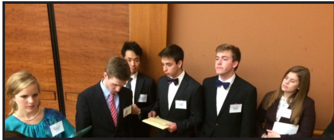
Representatives of the Third Committee discuss a proposition for an educational program to decrease violence perpetrated against women.

"You are the only one can shape tomorrow. Shape it the way you want it to be, and make the best out of it," said Rusesabagina as he concluded his speech.