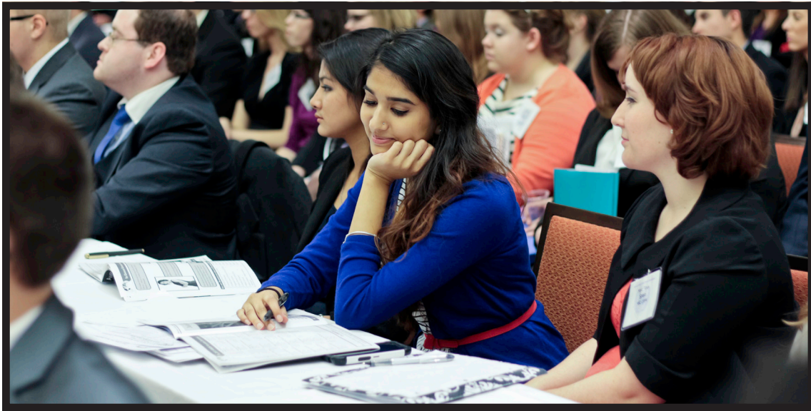
AMUN International returns to the Sheraton Chicago Hotel and Towers for the 24th annual Conference. Welcome all! Now let's start changing the world.

Representatives are earnestly discussing developing a solution to global corruption. Suggestions include forming a special committee focusing solely on African nations and a voluntary reporting body which would serve as an open forum on the topic.