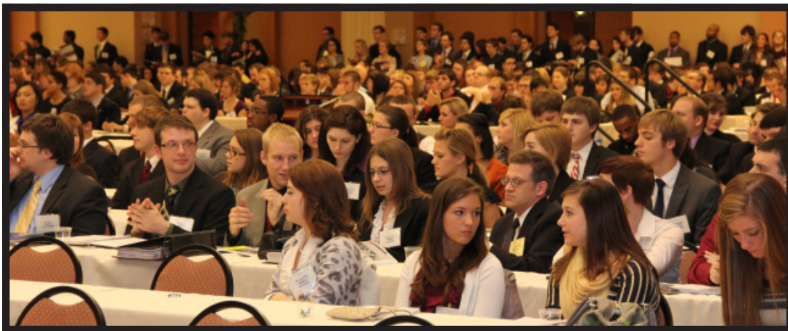
AMUN International returns to the Sheraton Chicago Hotel and Towers for the 24th annual Conference. Welcome all! Now let's start changing the world.

7 Two quick-thinking men on Newfoundland's northeast coast managed to save a Greenland shark from choking to death on a large piece of moose hide this past weekend. Two men were pulling on the moose chunk that had been partially consumed by a Greenland shark. One rescuer pulled a rope while the other one pushed with his boot in order to get the shark back into the deep water.