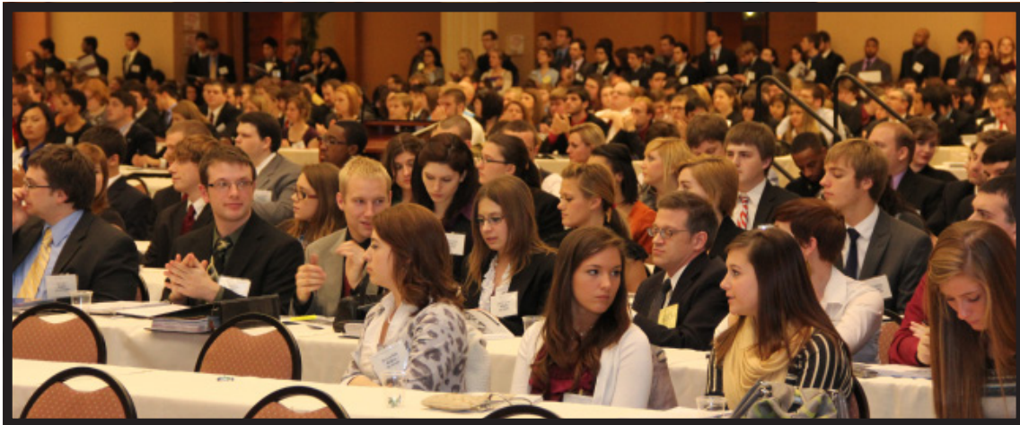
AMUN International returns to the Sheraton Chicago Hotel and Towers for the 24th annual Conference. Welcome all! Now let's start changing the world.

7 Two quick-thinking men on Newfoundland's northeast coast managed to save a Greenland shark from choking to death on a large piece of moose hide this past weekend. Two men were pulling on the moose chunk that had been partially consumed by a Greenland shark. One rescuer pulled a rope while the other one pushed with his boot in order to get the shark back into the deep water.