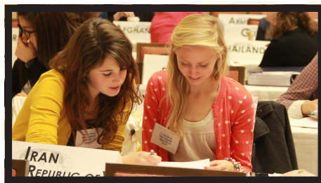
ESCAP Members deliberate on draft resolutions in ESCAP.