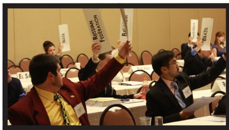
CPD CPD votes on a draft resolution in their last session.