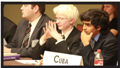
HSC90 Cuba ponders the situation in HSC90.