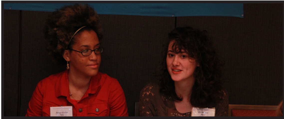
Representatives from Peru address the Press and call for better plans for disaster prevention and response.

9 The Commission for Population and Development is currently focusing its efforts on debating resolutions and writing reports on the topics of health-care, education, and migration. The Members of the Commission have been actively seeking consensus through compromise.