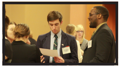
GA Plenary Debate continues on all topics in General Assembly Plenary.

Personal Ads: While not everyone enjoys a pickle, they are my bread and butter meal, and I always relish the time spent masticating one. -- Mr Vlassic § Kazakhstan delegates to the General Plenary are the best delegates representing the best country in the world. We encourage anyone to send them praise. Shout out to Panama!! § It was a dark day in 4th committee. § Two Gavel to the Face!