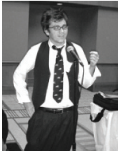
Representative Colin McCann of Venezuela debates counter-terrorism issues.

Spain took a different approach. "The Kingdom of Spain is committed to combating terrorism through the means of economic development rather than choking those countries' economies with further sanctions," Representative Ross Sidor of Spain said yesterday. Spain believes that poverty drives vulnerable countries' citizens