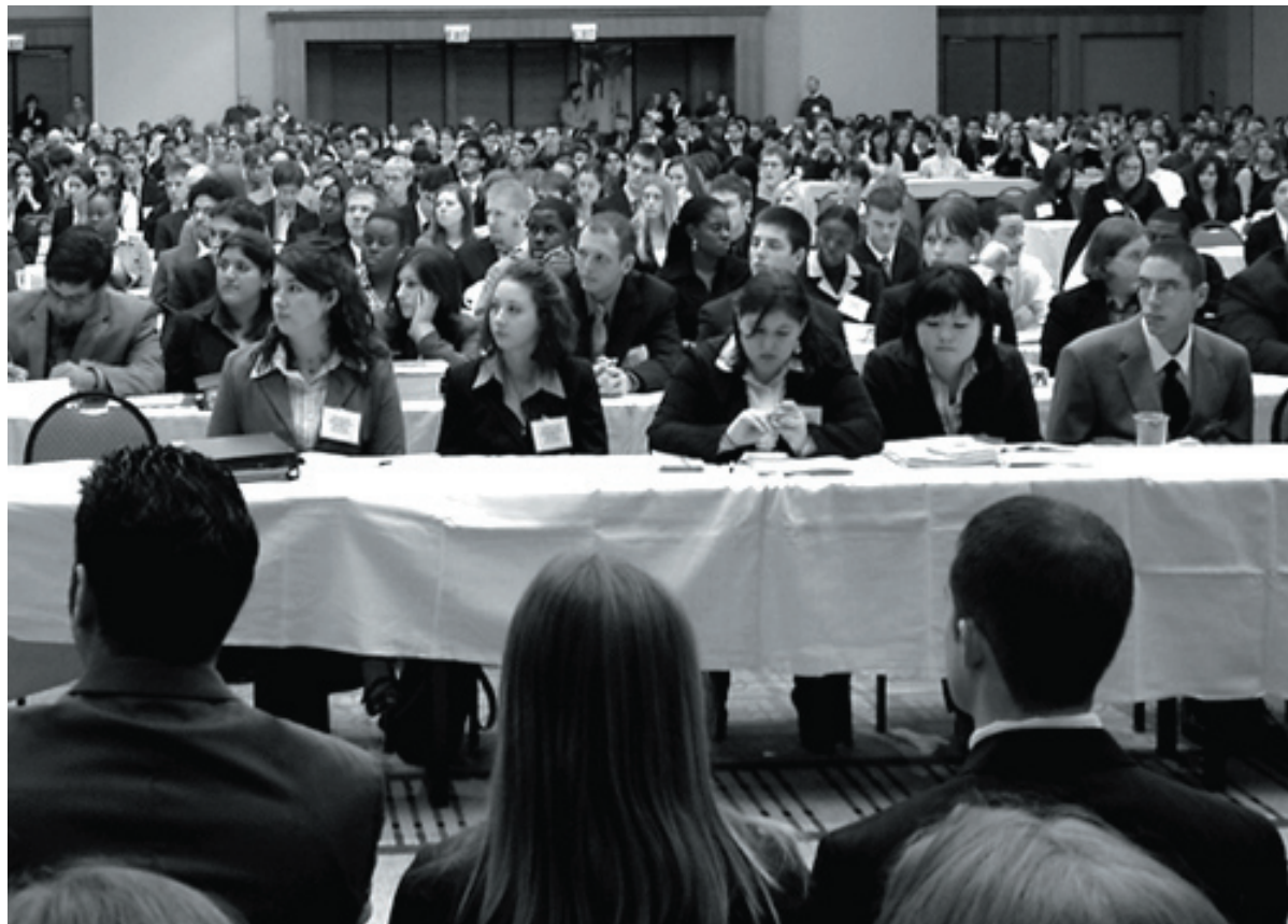
Representatives eagerly await the start of conference.