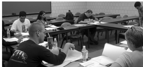
AMUN Secretariat members train in Home Government at the 2003 Labor Day Training Meeting.

What do I do if I am interested in joining Staff? If you think you might be ready to apply for the Secretariat, approach any member of the Secretariat. They can give you a Staff application - or tell you where you can find one. Staff applications can also be found at Conference Services - where you will find blue-badged Secretariat members happy to answer any questions you have. We hope you will consider applying, and I look forward to working with you next year!