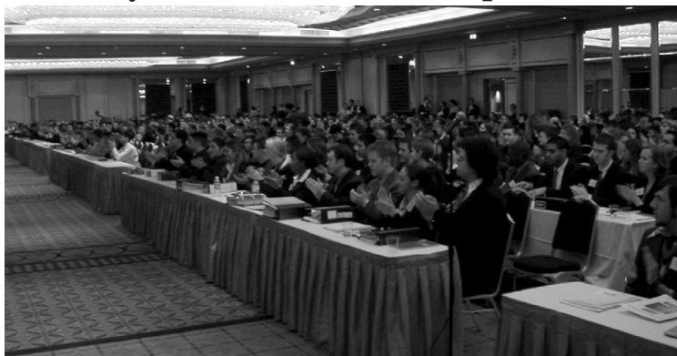
Over 1,000 Representatives attended the Opening Plenary session of AMUN 2002. This year's conference expects the attendance of nearly 1,200.