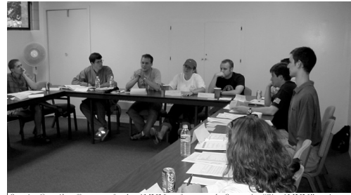
Security Council staff prepare for the AMUN conference at the Secretariat "Sim AMUN" session.

In practice, the UN Security Council commonly holds open meetings, by which Member States not represented on the Council can gain intelligence on important matters of international peace and security and can make an official statement of policy before the Council. Likewise, the AMUN Security Council may choose to hold an "Open Debate Session" if a topic is deemed so important that this is desired, or if several nations express interest in addressing the Council on a specific topic.