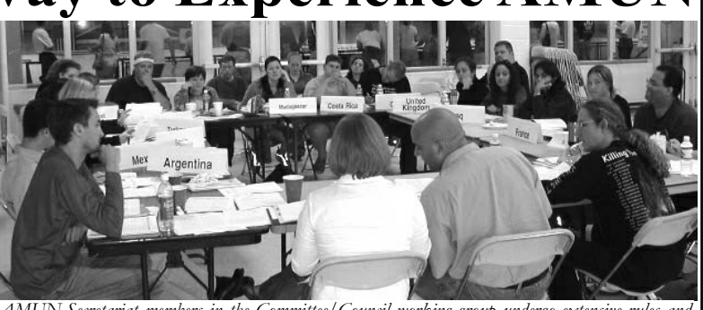
AMUN Secretariat members in the Committee/Council working group undergo extensive rules a chairing training during AMUN's annual Labor Day staff training weekend.

Blood, sweat and tears. No, just kidding. Producing a wellrun, professional Model UN Conference takes a lot of work there is no question about that. But, it can also be a lot of fun too. If you are selected for the Secretariat, you will be given a pre-Conference assignment and an at-Conference assignment. Pre-Conference assignments primarily involve conducting research for use in the Issues at AMUN