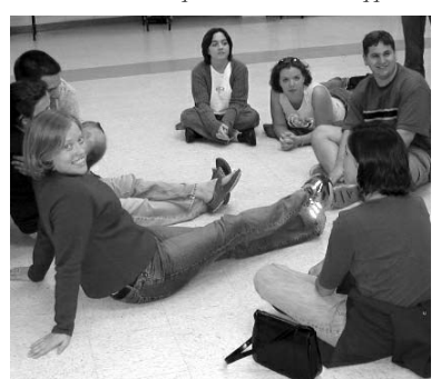
Staff members work in small groups during the Labor Day Training Meeting.

Where do I go? AMUN is open for business